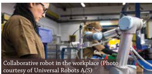
Collaborative robot in the workplace

One of the most interesting developments in robotics is the emergence and growing popularity of so-called collaborative robots, or cobots. Cobots, in contrast to traditional industrial robots, are designed to work side-by-side with human workers in a shared workspace. They are typically smaller and less powerful than traditional robots and are equipped with a variety of proximity sensors, load sensors, and other features designed to reduce the risk of dangerous interactions with the people working around them. This focus on safety means that cobots are easier to deploy in a normal factory setting, since they don't require special fenced off operating areas. Cobots are also designed to be easy to program, so that setup is simplified and a cobot can be easily and quickly reconfigured for new tasks. Cobots have been used to perform repetitive tasks in light assembly, packaging, materials handling, and medical laboratories. Remote and minimally invasive surgeries are another area of application. Cobots are also used in environments where direct human interaction could be dangerous, including high temperatures, chemically aggressive reagents and toxic pathogens, to name a few. (In particularly harsh environments, cobots designed for normal factory operations may require special measures such as protective wrapping or extended end-effectors to ensure reliable long-term performance.)